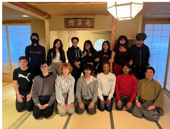
Day 2- Sa-Do, Meditation & Omoiyari