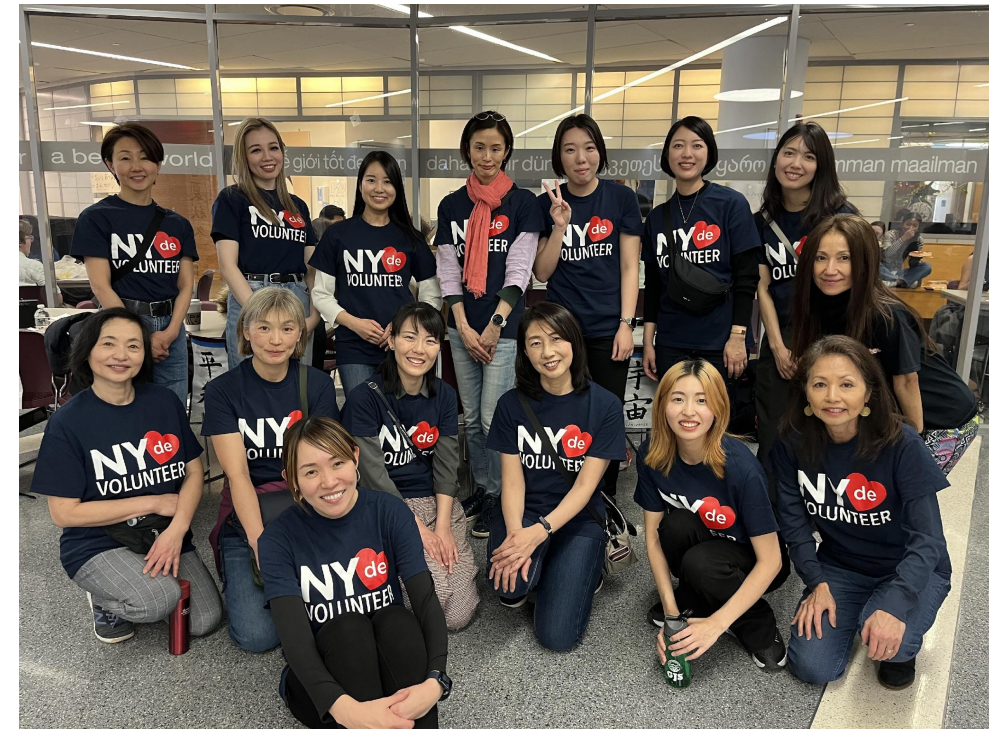
At UNIS Harumatsuri – March 2023

Throughout the year, NYdV supports Columbia University, New York University, and other colleges by aiding their students in Japanese language programs, primarily through conversational practice. This support takes place via Zoom or, more recently, through resumed in-person conversations."