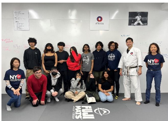
Day 1- Karate-do, Practice and spirit