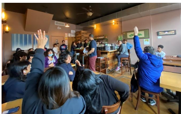
Day 4-Obento & learn about Japanese food